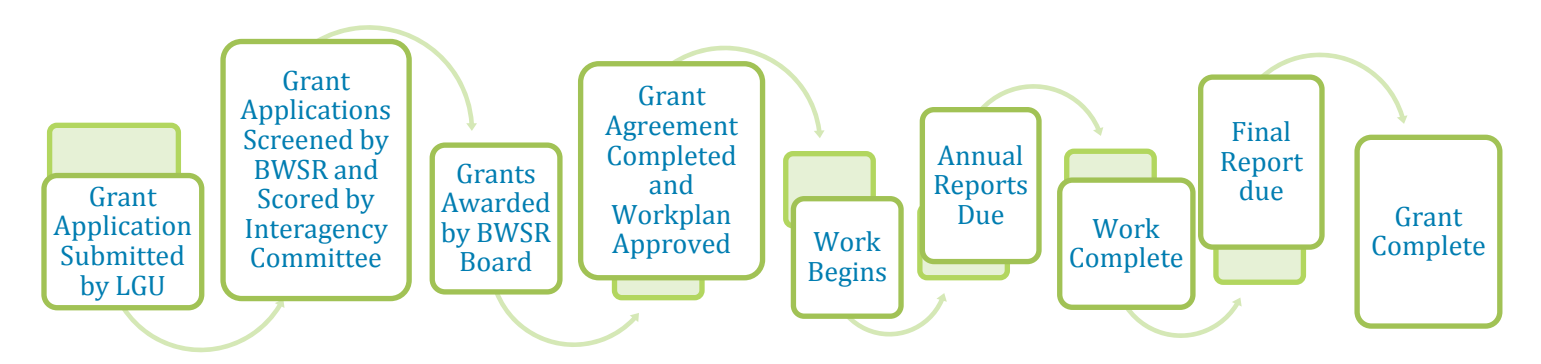
BWSR's competitive grant process

Competitive Grants, such as those awarded through the Clean Water Fund cycle, are often used by LGUs to complete specific projects or repair problems. In 2013, BWSR awarded 112 CWF grants totaling $18,342,362 to Minnesota LGUs. While most Clean Water Fund grant agreements are three years in length, the full competitive grant process--from application to closeout—can add an additional six to nine months to the duration. During the grant period, annual reporting is required to provide accountability and trigger interim payments.