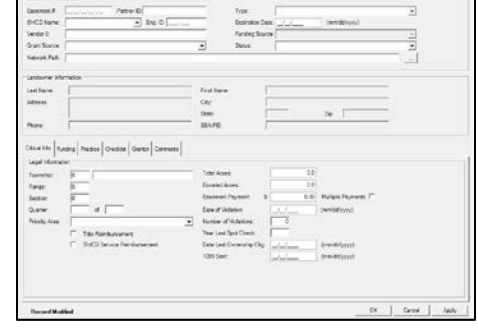
FoxPro Database Interface