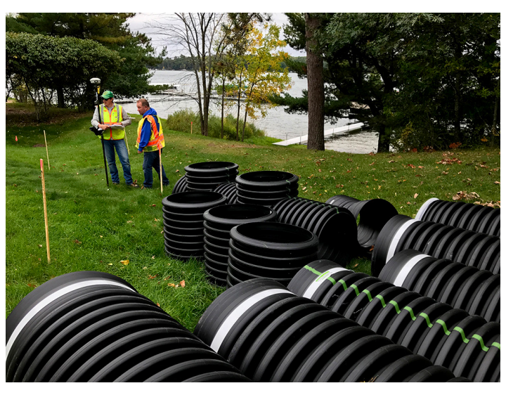
A crew from Brainerd-based Technical Service Area 8 surveyed the site of a stormwater treatment project in September 2017 off Crow Wing County Road 66 just outside Manhattan Beach. The project is estimated to keep 40 pounds of phosphorus out of the lake annually.

"We're often on the edge," said Owen Baird, a Brainerd-based Minnesota Department of Natural Resources fisheries specialist. "The cold water's there, but the oxygen's kind