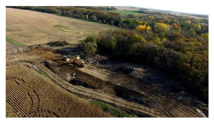
Top: Cody Fox, project manager for the Cedar River Watershed District, visits Dwane Hull's property in September just outside Austin. The gully on is among 25 priority fixes. Above: The view from a drone shows the berm under construction in fall 2017 on Hull's property.

Hull built the berm in 2002 to fix an expanding gully. He replaced it two years later after a hard rain destroyed the berm and blew the