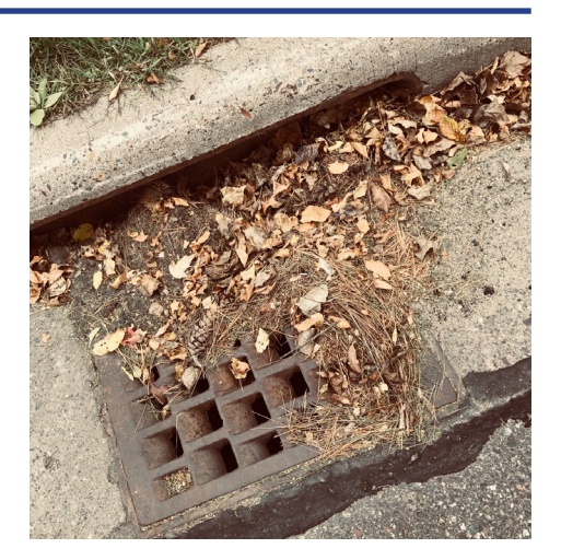
A $1.5 million Clean Water Land & Legacy Amendment award, leveraged with funds from watersheds and cities, will advance applied research that delves into questions about efficient, effective urban runoff treatments. The 20-member Minnesota Stormwater Research Council is behind the effort.