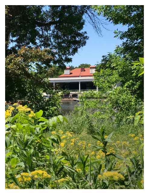
Rain gardens such as this one at Como Park Zoo and Conservatory in St. Paul are among the practices currently used to treat urban stormwater runoff.

They are: best management practices' cost effectiveness, characterization of stormwater runoff (what's in it, where is it coming from, can it be monitored more effectively), pollutants of concern (sediment, nutrients and chlorides), pollution reduction practices, innovative practices, improved maintenance of practices, behavior modification, and stormwater management policy.