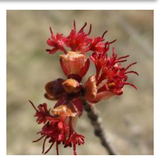
Red female flowers above and newly developing seeds below