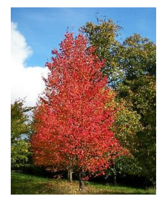
Red maple, fall color