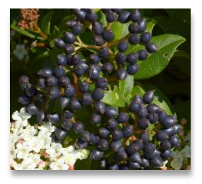
Berry-like drupes of Nannyberry

Viburnum lentago is common through most of Minnesota and is winter-hardy to Zone 4. Outside of Minnesota it can be found in the Northeast from New Brunswick and Quebec, Canada to Colorado and Virginia in the United States. Its natural habitat includes rocky, mesic, and low woodlands along streams or swamp borders, thickets, roadsides and fence rows.