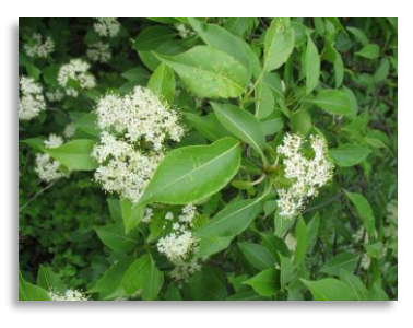
Flat-topped flower clusters and finely serrated leaves

Nannyberry is a shrub that is both beautiful and versatile. This shade-tolerant, woody plant has flat topped white flowers, fruit that is used by a wide