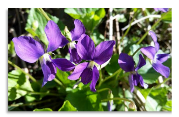
Colony of common blue violet

Statewide Wetland Indicator Status: • FAC