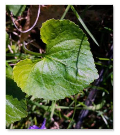
Heart shaped leaf with blunt tip

Five broadly spreading petals of a single flower, ¾ to 1 inch across, are typically deep-blue violet, fading to white and then pale yellow at the base. While some variation exists, all flowers exhibit this yellowish fading and side petals with tufts of white hair or beards. Lower leaves are heavily veined with dark violet lines that guide insects to the nectar of the flower. Leaves are basal, beginning at the base of the plant at the root. Heart shaped leaves are 2-3 inches long and 2-3 inches across with a blunt tip on leaves higher up and more rounded tipped on leaves lower to the ground. Flowering stems are leafless, around 6 inches tall, and range from few to several and smooth to