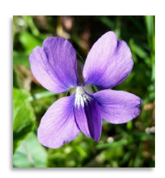
Flowers can make decorative edibles