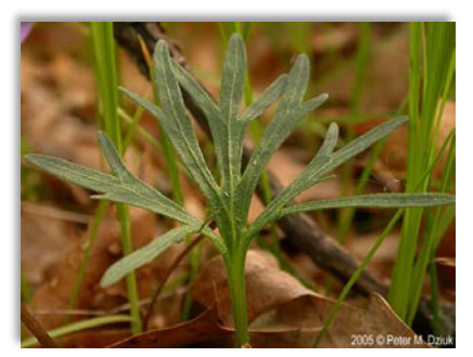
Deeply lobed leaf of Prairie Violet

With over 21 violet species in Minnesota, most of which are blue to purple or white, it can be difficult to identify Common Blue Violet. Two commonly mistaken violets are Birdfoot Violet (Viola pedata) and