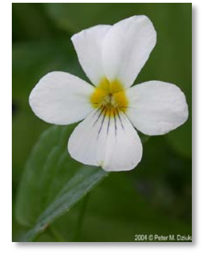
Dark yellow center of Canadian White Violet

Prairie Violet (Viola pedatifida). While difficult to tell the two apart, Birdfoot Violet and Prairie Violet differ from Common Blue Violet by their heavily lobed leaves. Rare white variations of Common Blue Violet are sometimes mistaken for Canadian White Violet. Common Blue Violet in its white variation has a pale yellow center while Canadian White Violet (Viola canadensis) has a distinct dark yellow center. Canadian White Violet also has leaves that branch from the stem, while Common Blue Violet's leaves only come from the base of the plant at the root (referred to as basal).