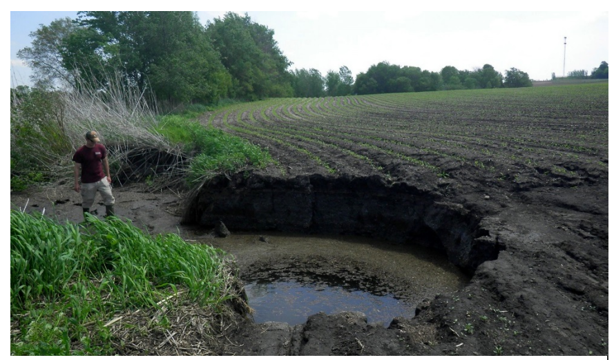
Andrew Grean, wetland specialist with Wright County SWCD, surveys damage in 2015 along Joint Ditch 15 about five miles south of Cokato. A severe example of erosion, an estimated 33 tons of sediment has been lost from the site over the years.

Because JD 15 is the headwater of Cokato Lake, Sucker Creek and — ultimately — the North Fork Crow River, the effects rippled well beyond landowners within the ditch system. The North Fork Crow River feeds into the Mississippi River, which supplies drinking water to about 1 million Twin Citians. Those resources are impaired due to sediment and excess nutrients. A significant source of the impairments: sedimentation and erosion throughout the ditch system.