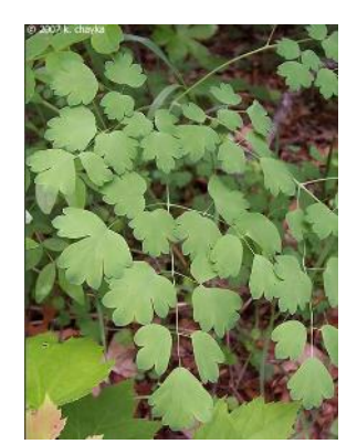
Early Meadow Rue leaves

Prairie Smoke ( Geum triflorum ) shares a red inverted flower, similar to the bell-shaped flowers of Red Columbine but it has leaves up to seven inches long with pointed leaflets. The leaves and stems are also hairy. Its range in Minnesota covers the western, central, and southeastern portions of the state. It also