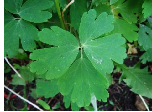
Red Columbine leaves

Although Red Columbine is the only native Columbine in Minnesota, it is widespread across the state and is commonly planted in gardens, shady