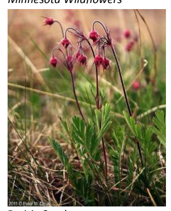
Prairie Smoke