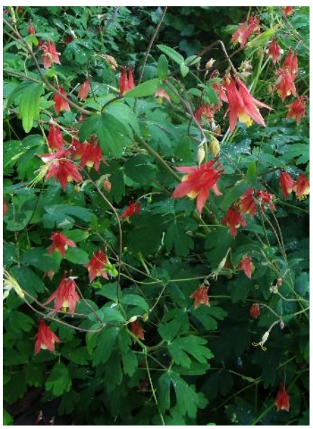
Red Columbine growing in a woodland garden