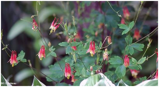
Red Columbine plant

bumblebees collect the pollen from its long stamens. Mammals rarely disturb the plant as the foilage is toxic to them. The larvae of Columbine sawfly ( Pristophora aquiligae ) feed on the leaves and can be very destructive, defoliating the plant if not dealt with early in the season. University of Minnesota Extension has tips for dealing with Columbine sawfly.