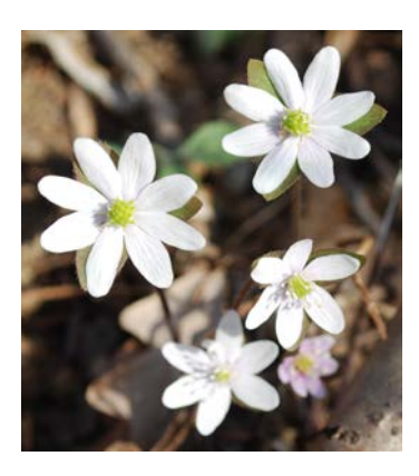
Sharp-lobed Hepatica (Hepatica acutiloba)

Hepatica has similar flowers, but are typically smaller than bloodroot, 1-1 ½" across. Stamens are white instead of yellow. Leaves with 3 eggshaped lobes developing after the flowers blooms.