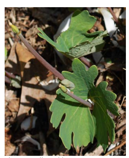
Flower stalk and leaves

Bloodroot is native north to Nova Scotia and south to Florida, from eastern United States to the Great Plains region. It thrives in deciduous forests with dense shade, near floodplains, streams and seeps that supply moist soil.