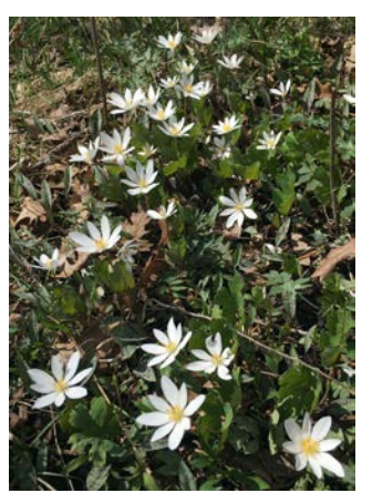
Flowers in colony