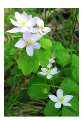
Rue Anemone (Thalictrum thalictroides)

Hepatica has similar flowers, but are typically smaller than bloodroot, 1-1 ½" across. Stamens are white instead of yellow. Leaves with 3 eggshaped lobes developing after the flowers blooms.