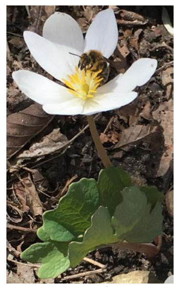
Bee on bloodroot flower

Statewide Wetland Indicator Status: • FACU