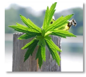
Finely divided basal leaf with coarse teeth.