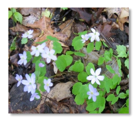
Rue anemone (Anemonella thalictroides) has a whorl of leaves with three teeth or shallow lobes, growing just below 2-3 flowers with green centers and 5-10 petallike sepals.