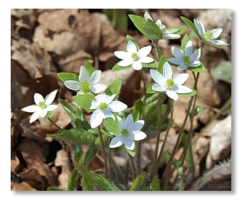
Thimbleweed (Anemone virginiana) has basal leaves with three lobes and coarse teeth. It has five white, petallike sepals and a thimble shaped center.