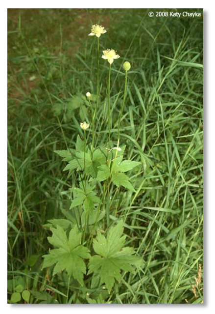
Thimbleweed (Anemone virginiana) has basal leaves with three lobes and coarse teeth. It has five white, petallike sepals and a thimble shaped center.