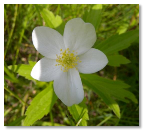
Single flower extending from a whorl of leaf-like bracts

Name: Canada Anemone (Anemone canadensis)