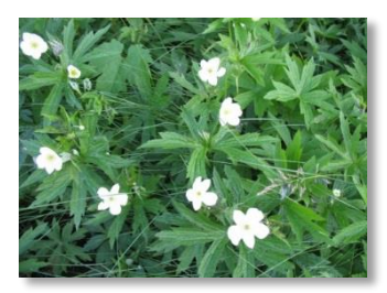
Dense growth form of Canada anemone.

The aggressive growth form of the species enables it to be widespread across Minnesota. It prefers calcareous soils with loam, sand or gravel, and is found in a wide range of plant communities including wet meadows, shrub swamps, mesic prairies, floodplain forests, streambanks and lakeshores. It is also found in some disturbed landscapes such as roadsides, agricultural ditches, and stormwater detention areas. It is mainly found in the eastern half of the United States and Canada.